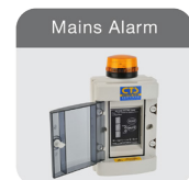
Mains Multi-Zone SWS2000 Cat Page: 99