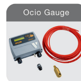
230v F0075510D Cat Page: 111