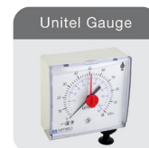
Percentage OAB9000 Cat Page: 107