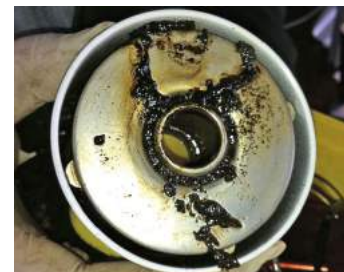
A filter clogged up with diesel sludge

For tanks that are used daily, a water filter can usually do the job, but if your tank has less frequent usage then the water is allowed to settle and the "bugs" are left to grow as described above. Unfortunately, generator tanks fall into this category, where you simply cannot risk downtime.