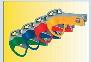
Different Colours Available