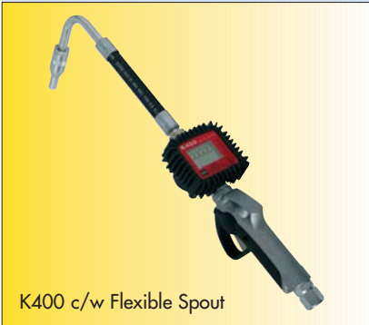
K400 c/w Flexible Spout

EASYOIL IS A NEW DISPENSING NOZZLE SPECIFICALLY DESIGNED FOR THE INDUSTRY. ITS MAIN ADVANTAGES ARE: