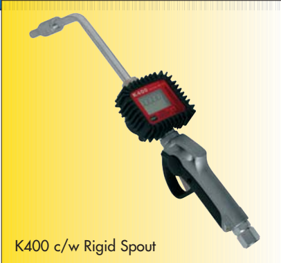
K400 c/w Rigid Spout